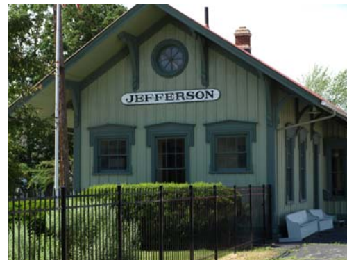
Adjacent Jefferson Depot & Village*

*Independently operated with additional separate admission charge.