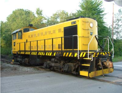
Engine #7371 crossing Griggs Road

Enjoy a one hour twelve mile round trip old fashioned train ride. Travel, as it was during the early 20th century, restful and unhurried. Sit back and watch our countryside roll by your window, as the whistle is sounded for each crossing. Our first generation diesel locomotive pulls three vintage coaches as you ride in either our Air Conditioned coach or two commuter cars. Investigate our rolling gift shop car enroute or have a light snack, with advance notice box lunches are available with a selection of sandwiches. The coaches were built in 1925 and 1927. All departures board the train at the Jefferson Depot platform, which is the start, and finish point of your ride. Travel begins northward to our Carson Yard interchange with Norfolk Southern. At times NS freight trains can be seen rumbling by on nearby trackage which runs between Ashtabula and Youngstown. The AC&J operates year round freight line as well as passenger operations.