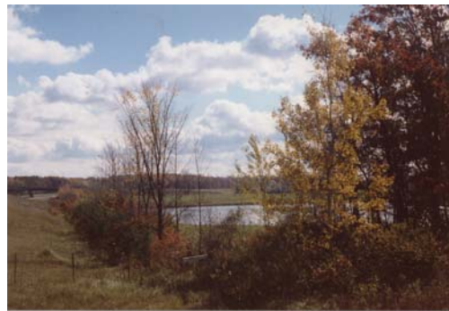
Fall Scene near our north end