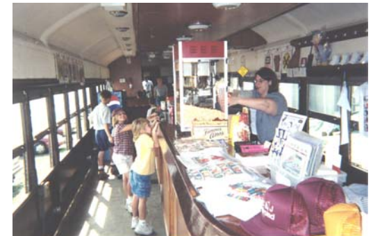
Concession car with Kids & Popcorn

Weekend private trips available either before or after our regular departures, leaving as late as 11:30AM or after 4:15PM on Saturday and after 4:15 PM on Sunday, no mornings.