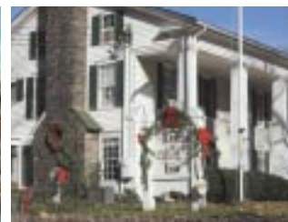
Rider's Inn B&B / Restaurant Motorcoach Friendly former Stagecoach Stop & part of Underground Railroad