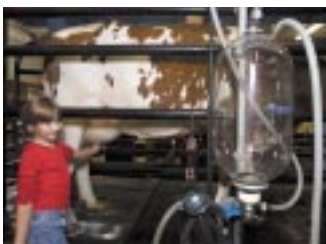
Lake Metroparks Farmpark