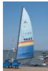
Lake Metroparks Fairport Harbor Lakefront Park

Lake County History Center, Painesville Twp., Ohio July 30-31, 2010