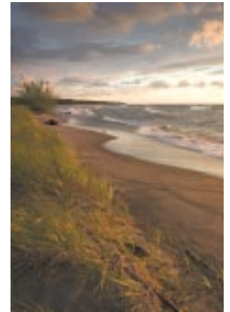
Mentor Headlands State Beach Park & Sand Dunes