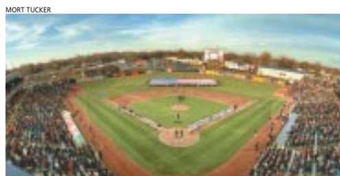
$27 Million Lake County Captains Classic Park Cleveland Indians Class A Baseball Team Available for group events