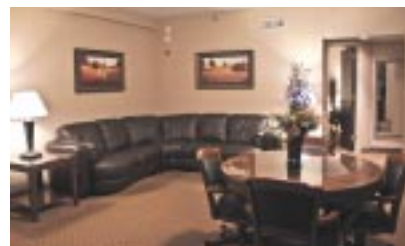
Holiday Inn Express Hotel & Suites La Malfa, Mentor $2.5 million renovation. 60,000 square foot conference center & hotel.

Ohio's Largest Nursery District • Lake Erie Beaches & 450 Acre Mentor Lagoons Nature Preserve, Featuring Birding & Nature Walks