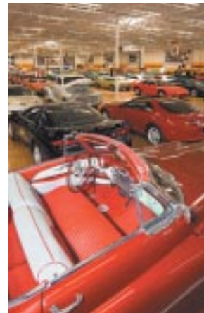
Mentor Museum of Speed