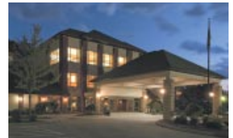
Quail Hollow Resort featuring meeting facilities and Quail Hollow Country Club with two championship designer golf courses

Fresh Group/Getaway Activities • Affordable, New/Updated Franchise & Boutique Hotels by I-90 near Cleveland