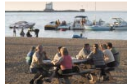
LAKE COUNTY PERCH FEST™ Free Admission • September 10-12, 2010