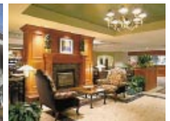
$1.7 million renovated Radisson Hotel & Suites, Cleveland/Eastlake