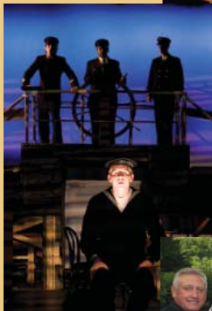
Titanic, the Musical, 2008