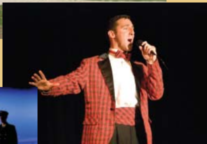
Forever Plaid, 2007